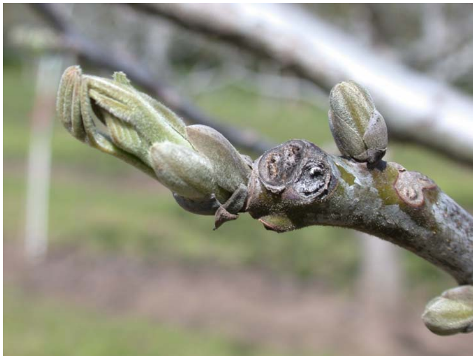
Figure 3. Bud break timing for Tehama County Chandler walnuts.